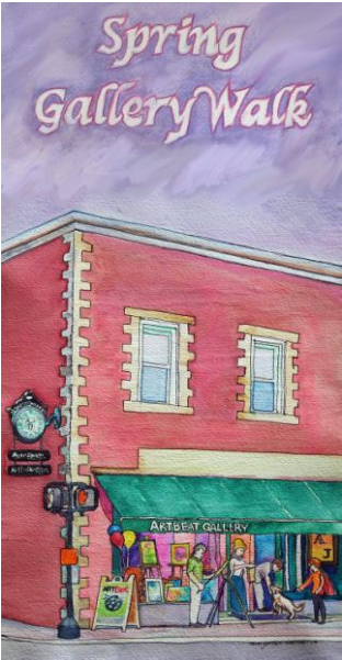
Spring Gallery Walk