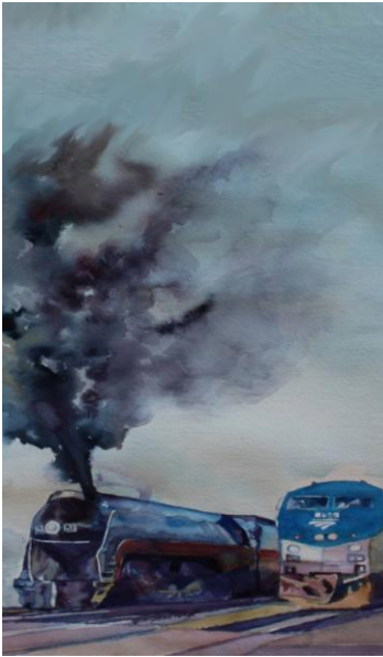
Steamie Greets the Diesel