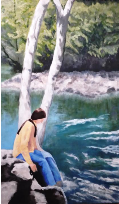
Gin on the Rocks