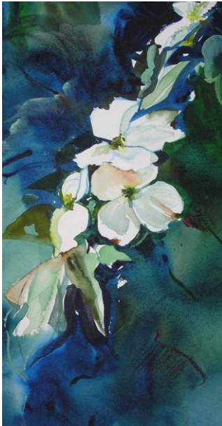
Dogwood Spirit Mist